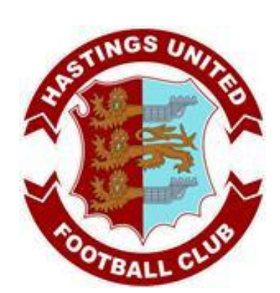
Ryman Premier Hastings United FC