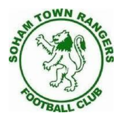
Ryman North Soham Town Rangers FC